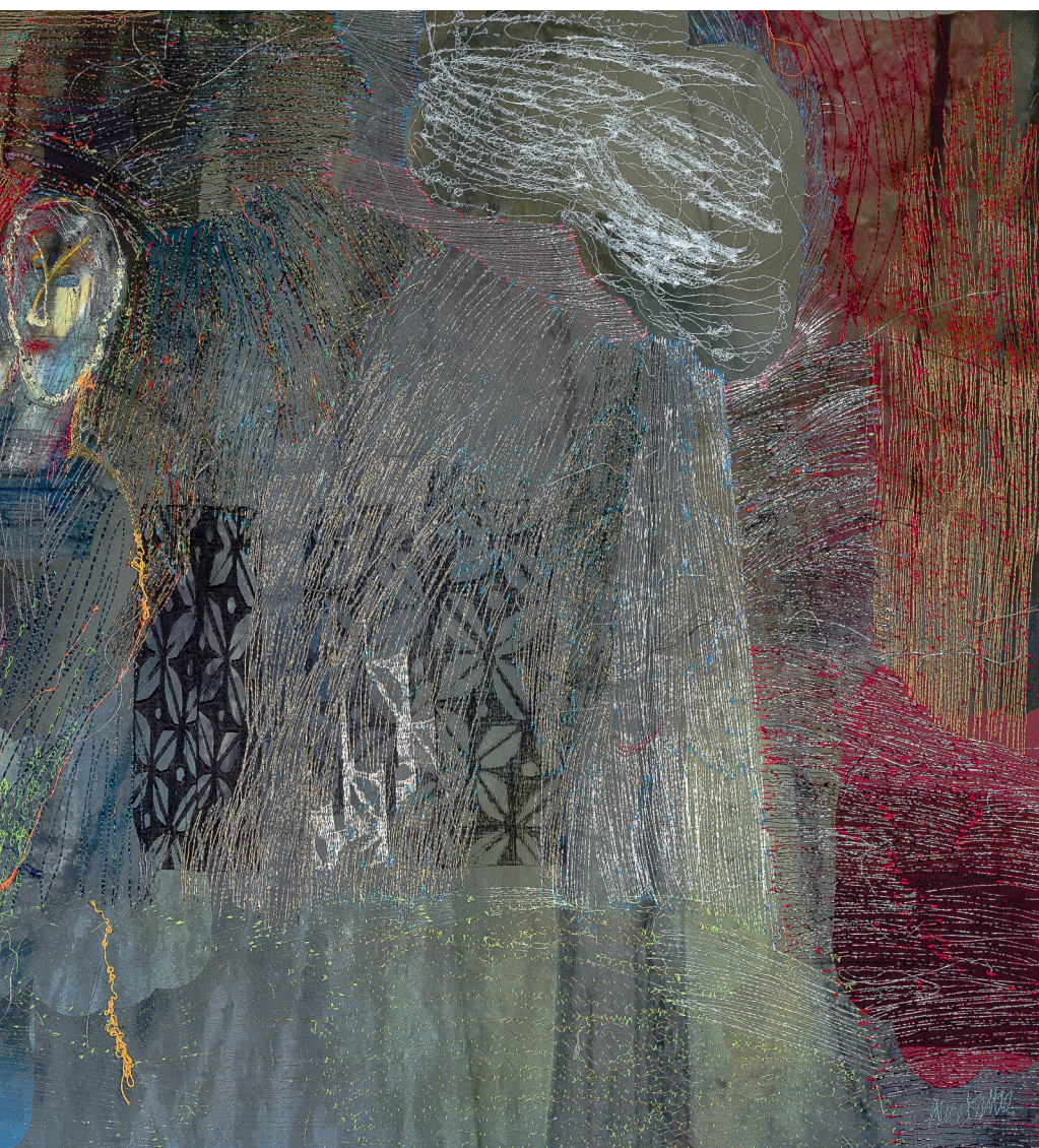
Beneath the Tree , 2019 by Alice Kettle Hand and Machine Stitch on Printed Fabric 93 x 167 cm With contributions from Assma, Syria