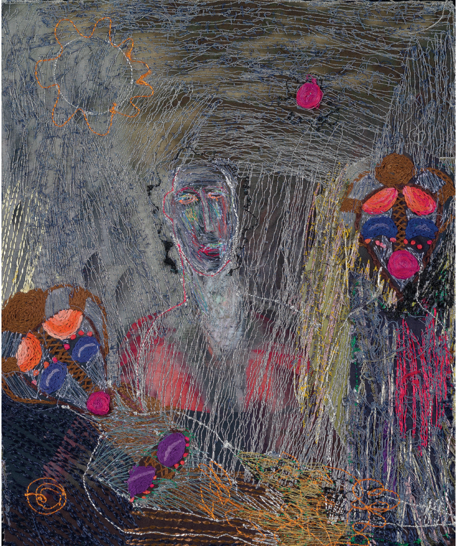
Three Women , 2019 by Alice Kettle Hand and Machine Stitch on Printed Fabric 42 x 35 cm With contributions from Susan Kamara, Uganda