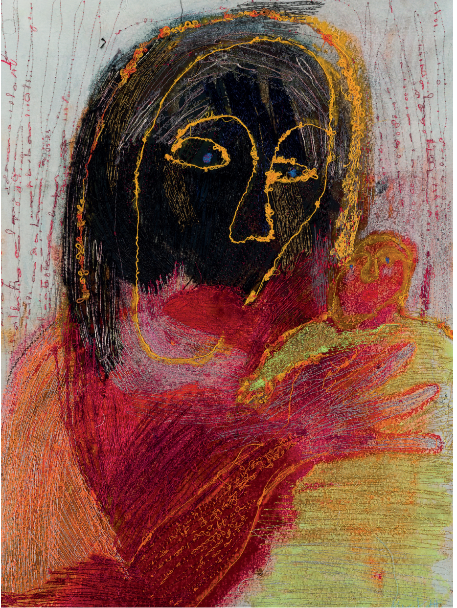
Portrait of Rosa's Child , 2019 by Alice Kettle Hand and Machine Stitch on Printed Fabric 73 x 54.5 cm