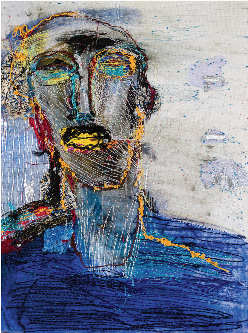
Blue Head , 2019 by Alice Kettle Hand and Machine Stitch on Printed Fabric 39 x 30 cm