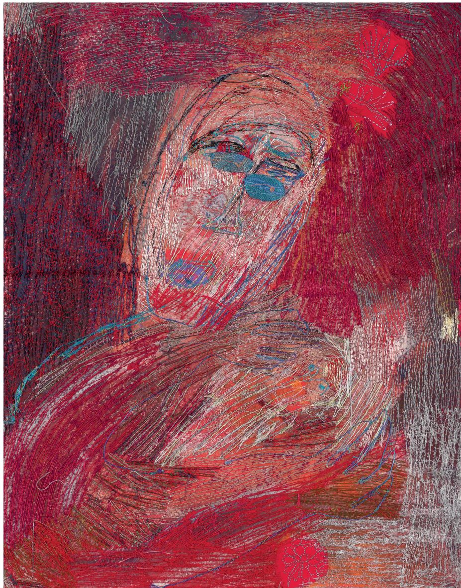
Mother and Baby, Red , 2019 by Alice Kettle Hand and Machine Stitch on Printed Fabric 76 x 59 cm With contributions from RLCC, Behbud, Indus Resource Centre, Pakistan