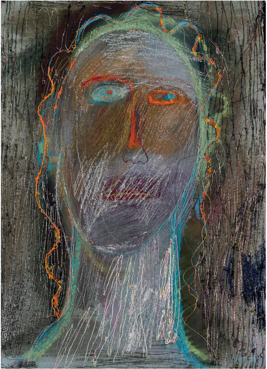
Portrait of Nel , 2019 by Alice Kettle Hand and Machine Stitch on Printed Fabric 84 x 60 cm