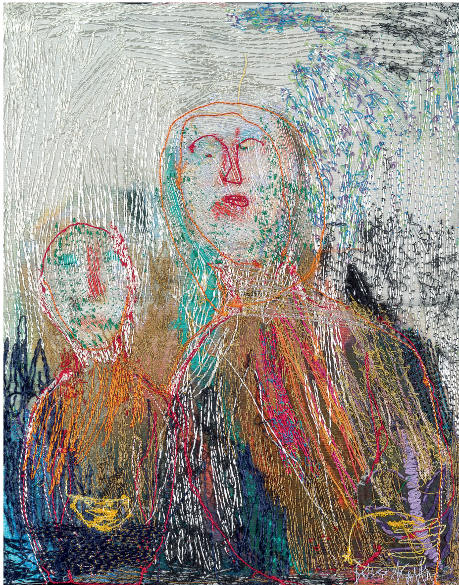
Mother and Child II , 2019 by Alice Kettle Hand and Machine Stitch on Printed Fabric 84 x 60 cm