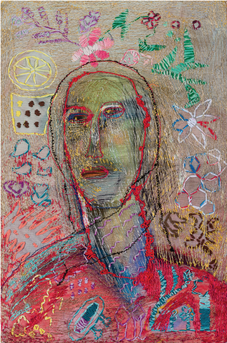
Us As One , 2019 by Alice Kettle Hand and Machine Stitch on Printed Fabric 44 x 29 cm With contributions from Assma, Syria