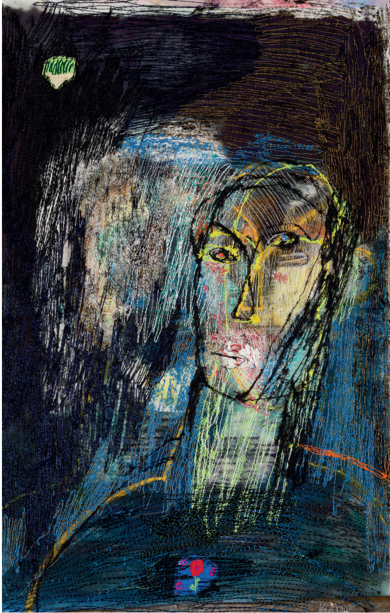
Woman Thinking , 2019 by Alice Kettle Hand and Machine Stitch on Printed Fabric 95 x 60 cm With contributions from RLCC, Behbud, Indus Resource Centre, Pakistan