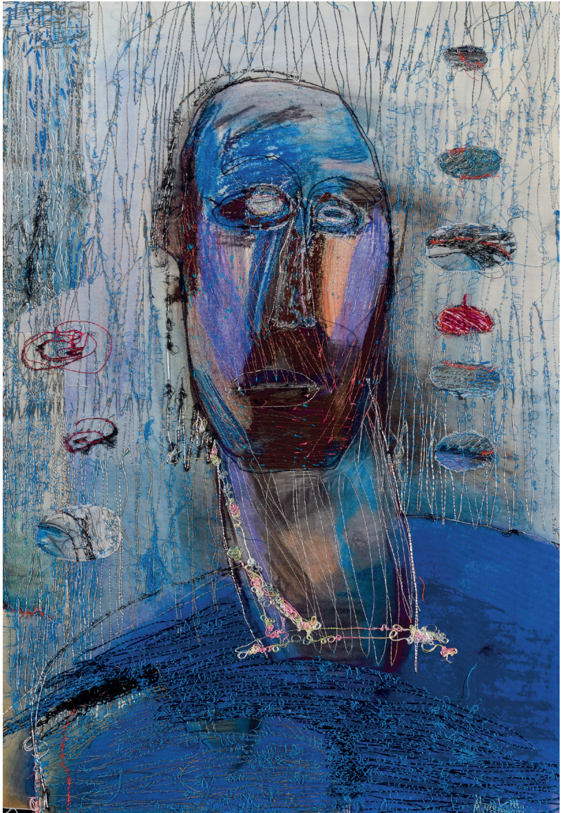
Portrait of Black and Blue , 2019 by Alice Kettle Hand and Machine Stitch on Printed Fabric 81 x 55 cm