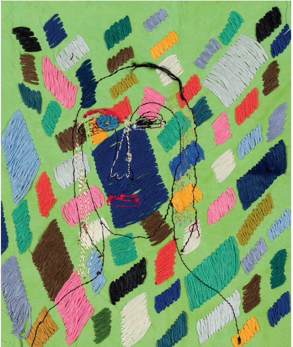
Green Girl , 2019 by Alice Kettle Hand and Machine Stitch on Printed Fabric 32 x 26 cm With contributions from Assma, Syria