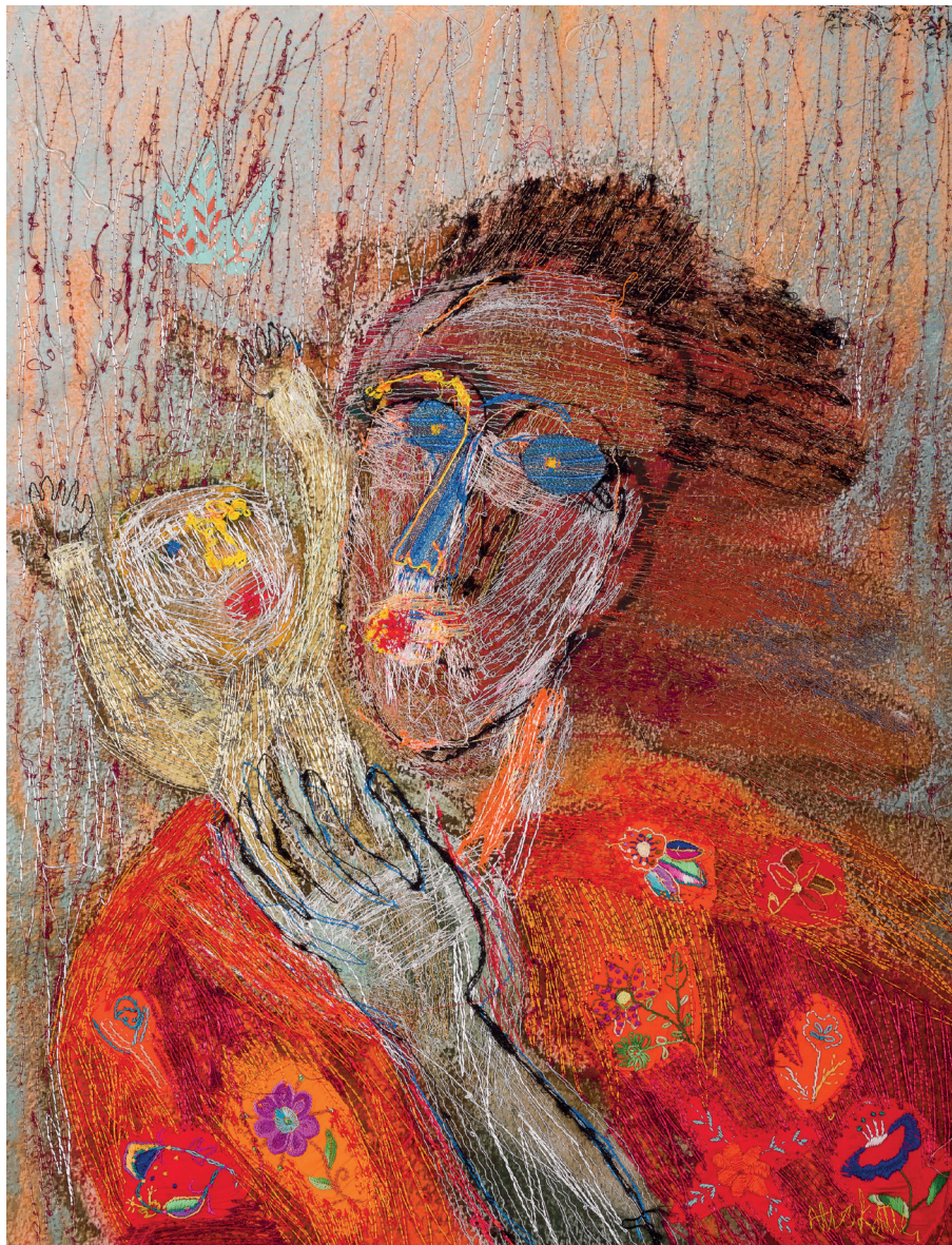
Woman and Baby , 2019 by Alice Kettle Hand and Machine Stitch on Printed Fabric 77 x 60 cm With contributions from RLCC, Behbud, Indus Resource Centre, Pakistan