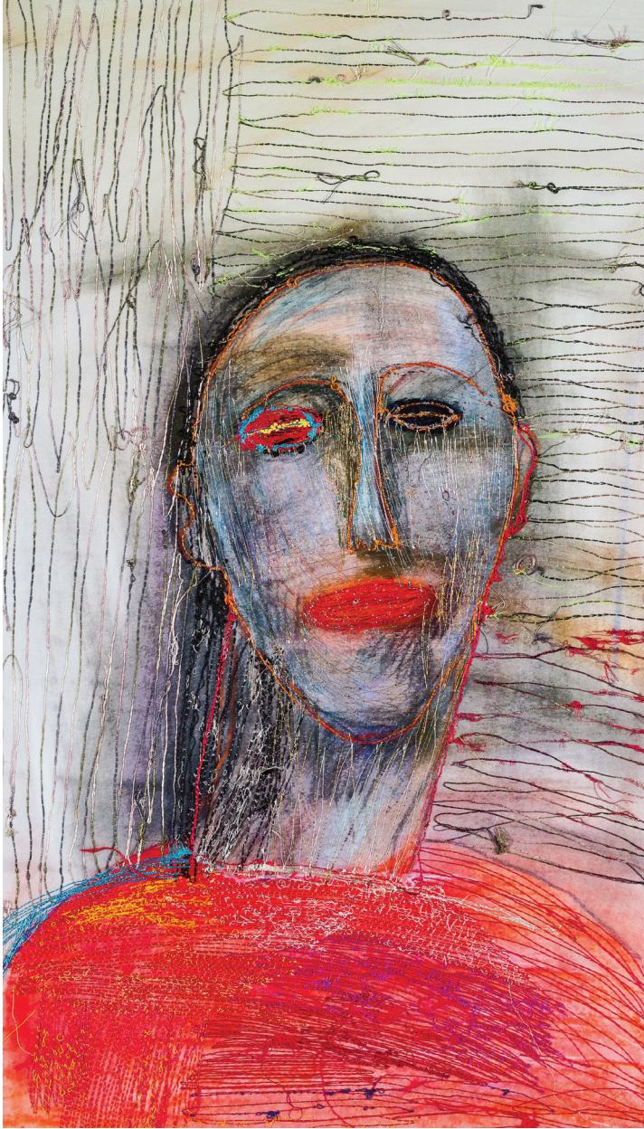
Portrait of Isa , 2019 by Alice Kettle Hand and Machine Stitch on Printed Fabric 92 x 54 cm