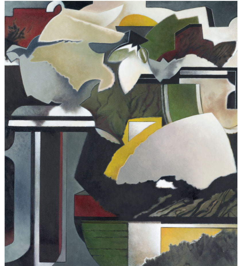
Figures of Speech I , 2018 Oil on Canvas 81 x 71 cm