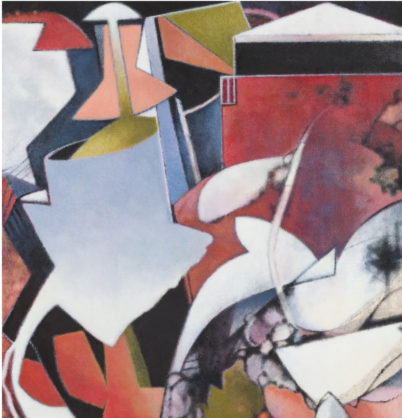
Track and Trace 1, 2020 Oil on Canvas 41 x 40 cm