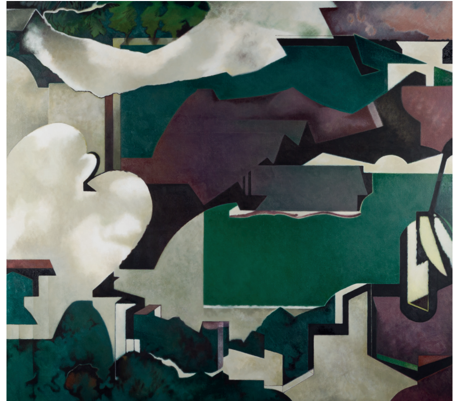
Nemesis , 2016 Oil on Canvas 110 x 122 cm