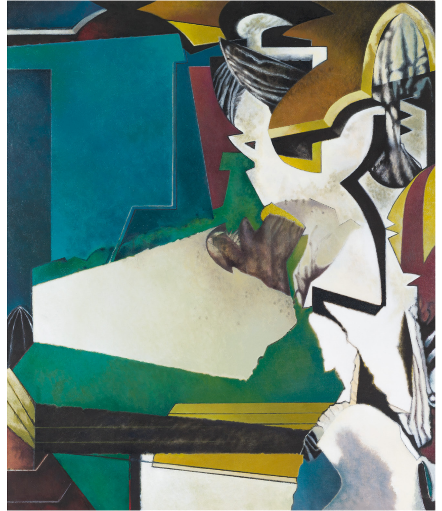
Soundings 1, 2018 Oil on Canvas 96.5 x 81 cm