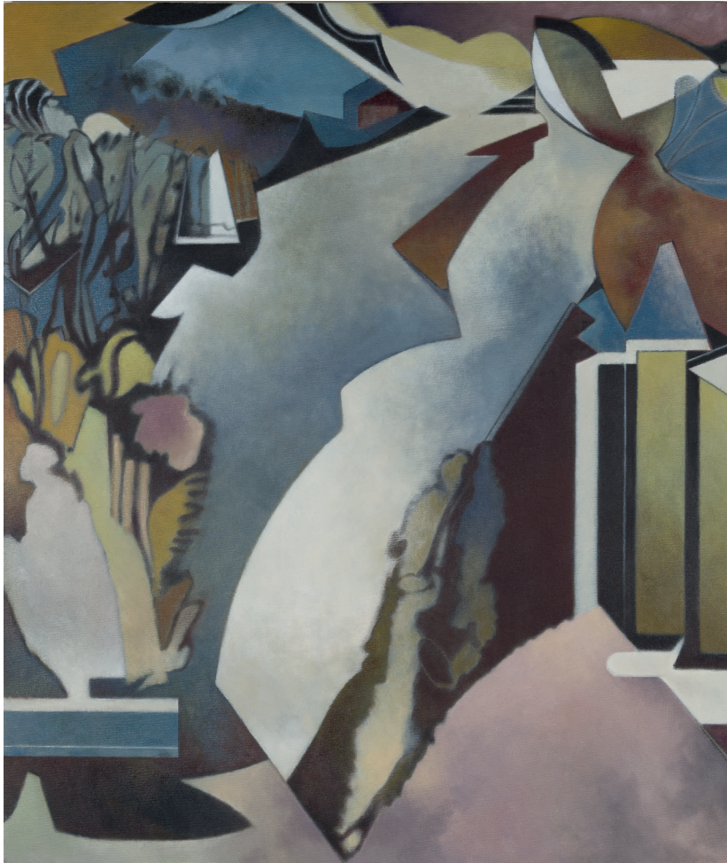
Soundings 3 , 2018 Oil on Canvas 97 x 82 cm