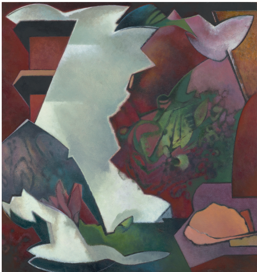
Shift I , 2019 Oil on Canvas 55 x 52 cm