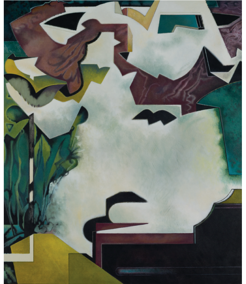
Soundings 4 , 2018 Oil on Canvas 96.5 x 81 cm