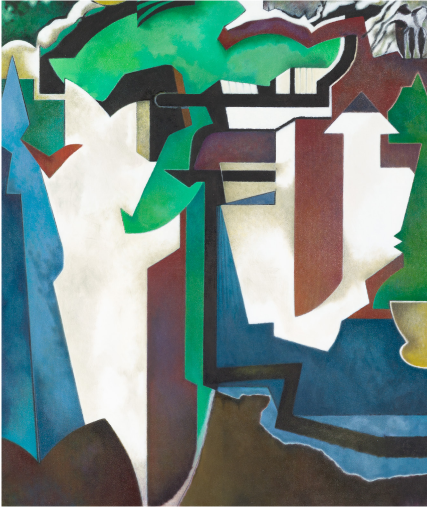
Soundings 2, 2018 Oil on Canvas 96.5 x 81 cm