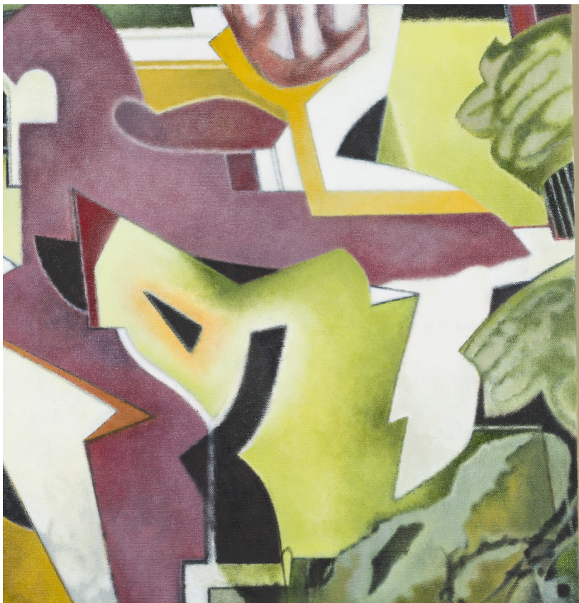
Track and Trace 3 , 2020 Oil on Canvas 41 x 40 cm