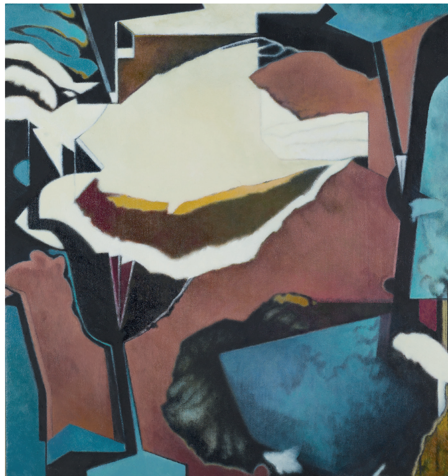
Shift II , 2019 Oil on Canvas 55 x 52 cm