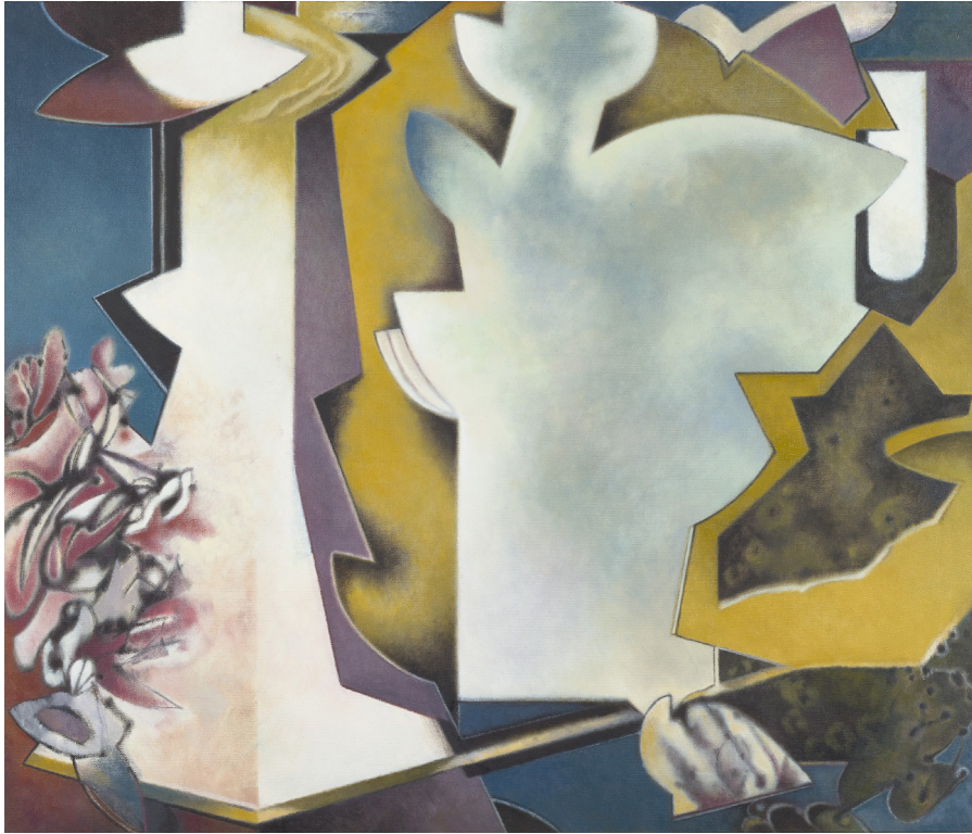
Impasse , 2019 Oil on Canvas 60.5 x 71 cm