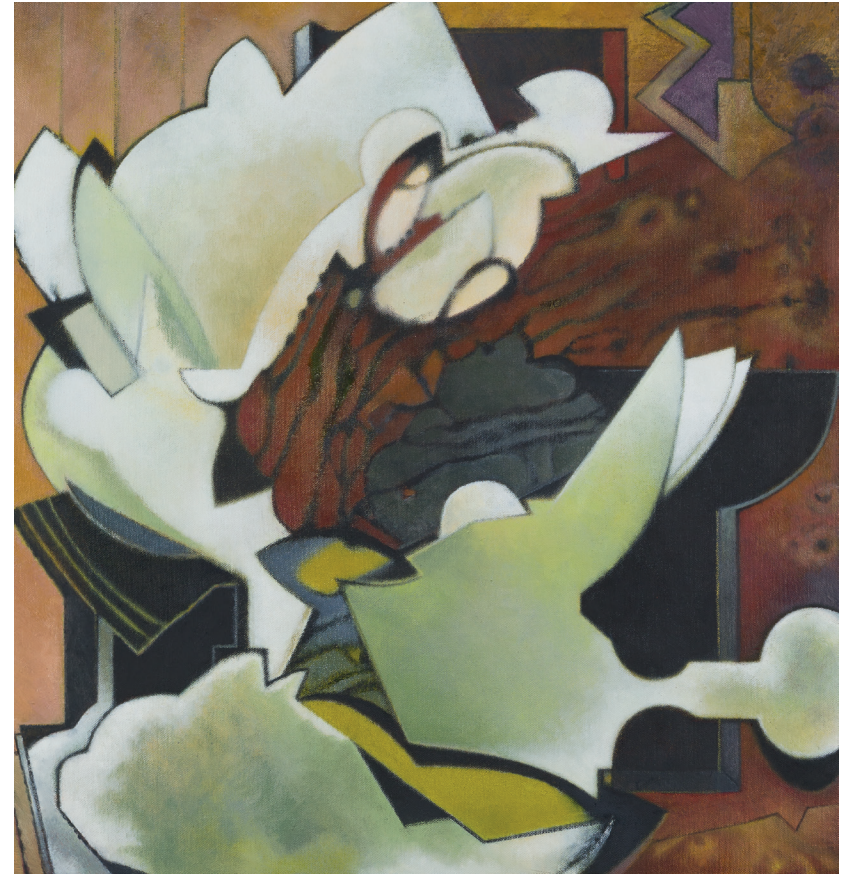
Shift IV , 2019 Oil on Canvas 55 x 52 cm