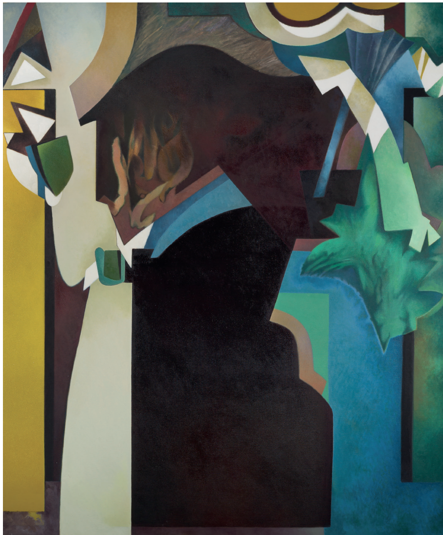
Lie of the Land 4 , 2009 Oil on Canvas 132 x 110 cm