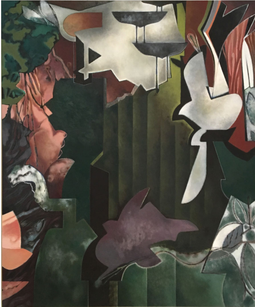
Surge , 2008-2017 Oil on Canvas 122 x 102 cm