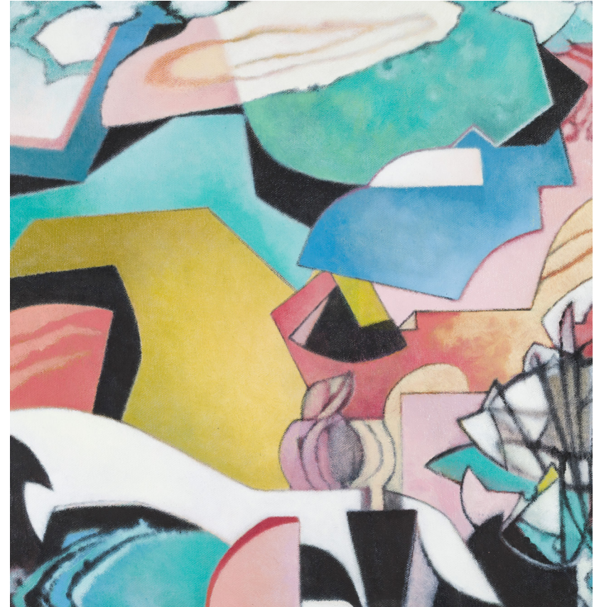
Track and Trace 2, 2020 Oil on Canvas 41 x 40 cm