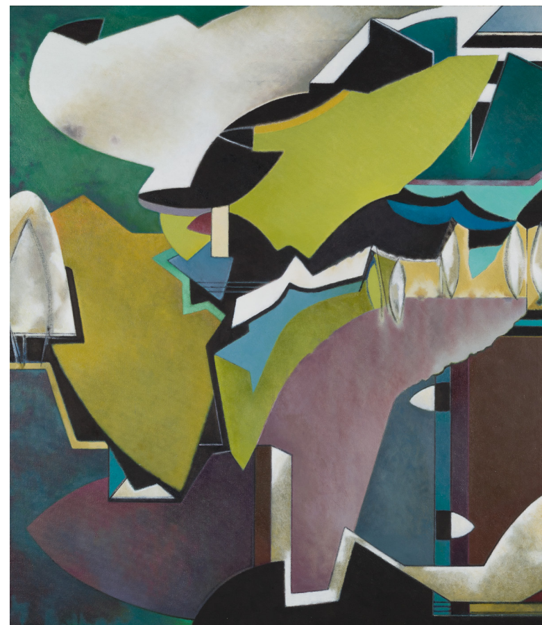
Figures of Speech II , 2018 Oil on Canvas 81 x 71 cm